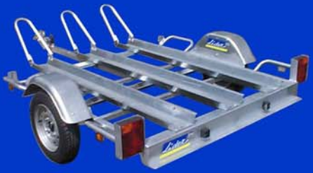
Motor-cycle 23420 fitted with 3 rails