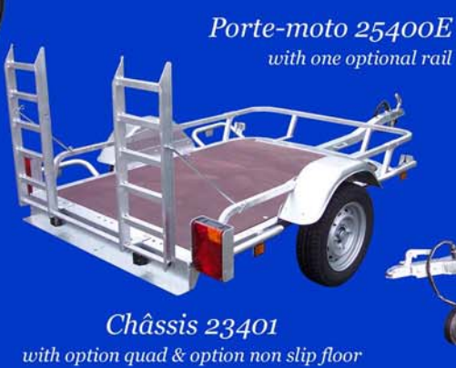
Porte-moto 25400E with one optional rail