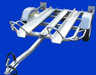
Storage position of mounting rail